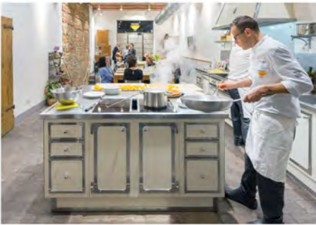
MaMa Florence Cooking School