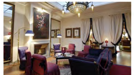
Hotel Cellai - Florence