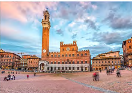
Piazza del Campo