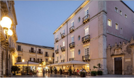
Palazzo Artemide, Siracusa