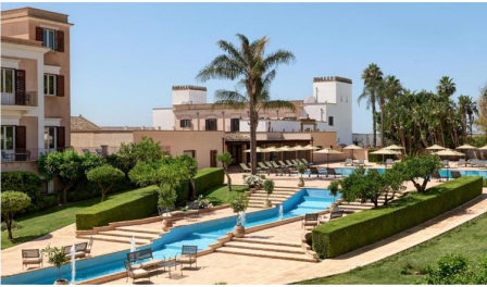
Almar Giardino di Costanzo, Mazara