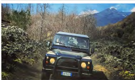
Mt. Etna - Jeep Tour