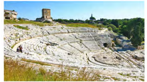
Archeological Park, Siracusa