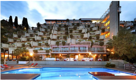
Monte Tauro, Taormina