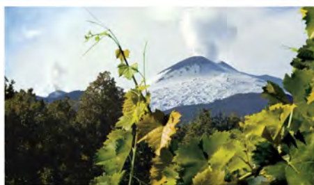
Mt. Etna - Passopisciaro Winery