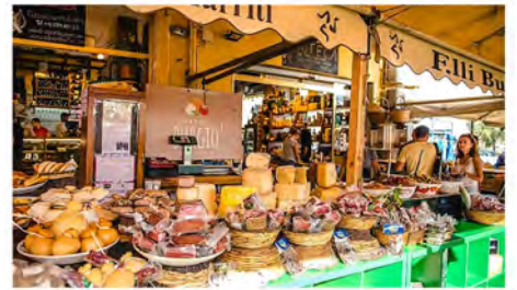
Fratelli Burgio's Salumeria