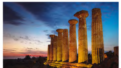
Agrigento - Valley of the Temples