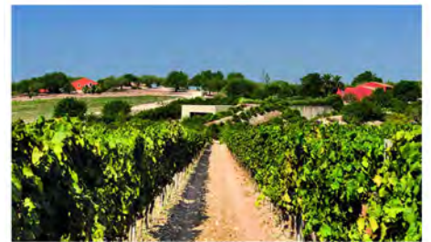
Planeta Buonivini Winery