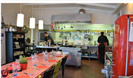
La Cucina del Sole Cooking School